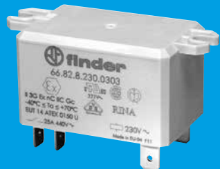
66 ATEX Rev. 1 04/09/2017