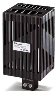
Type 7H.51.0.230.0100 Heating power 100 W