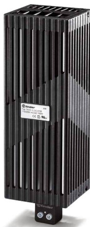
Type 7H.51.0.230.0150 Heating power 150 W